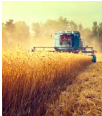
Manufacturing & Agriculture