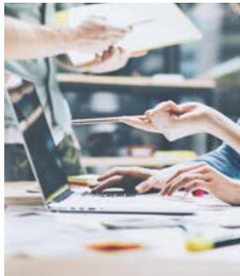
Media, IT & Telecommunications