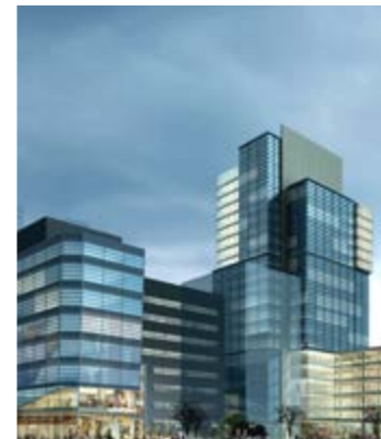
Real Estate & Development