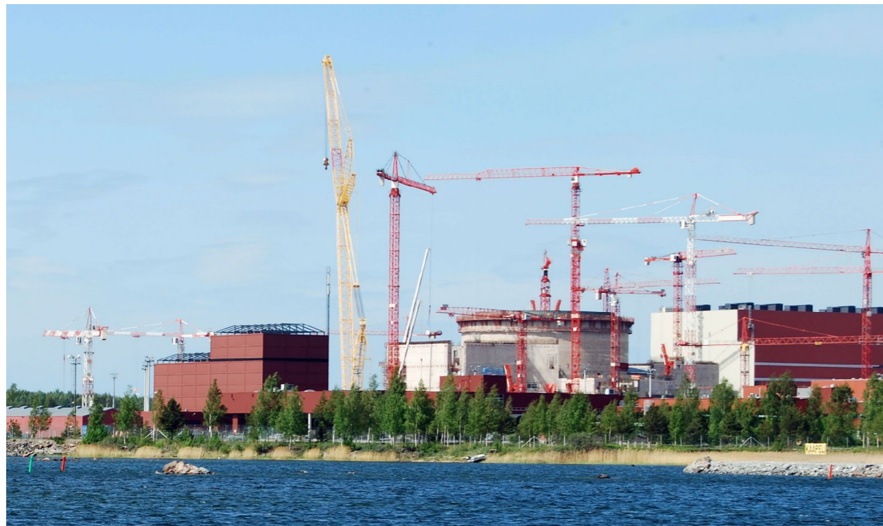
OLKILUOTO 3 NUCLEAR POWER PLANT OLKILUOTO, FINLAND