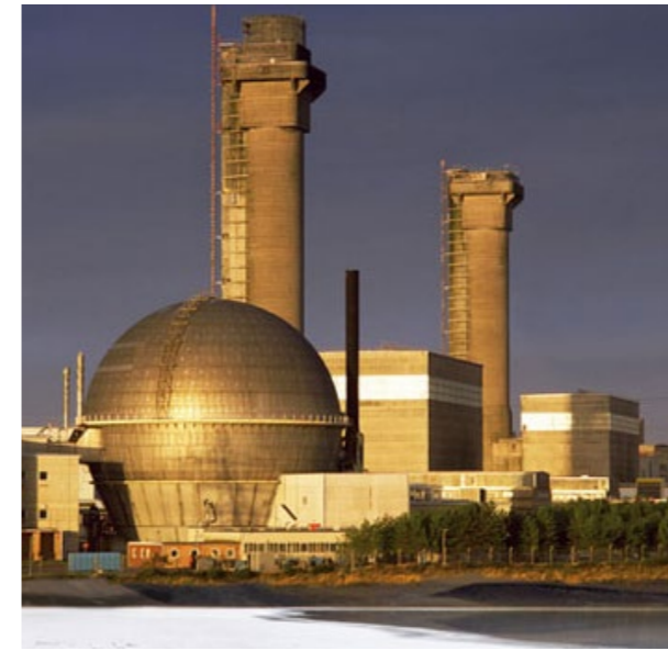
SELLAFIELD NUCLEAR REPROCESSING & STORAGE PLANT CUMBRIA, ENGLAND, UK