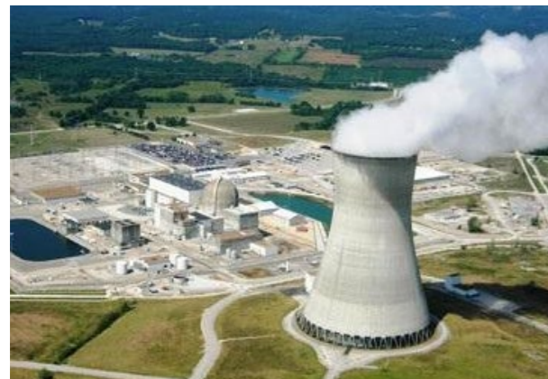
CALLAWAY NUCLEAR PLANT CALLAWAY COUNTY, MISSOURI, USA