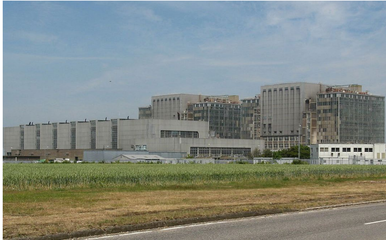
BRADWELL POWER STATION SOUTHMINSTER, ENGLAND, UK