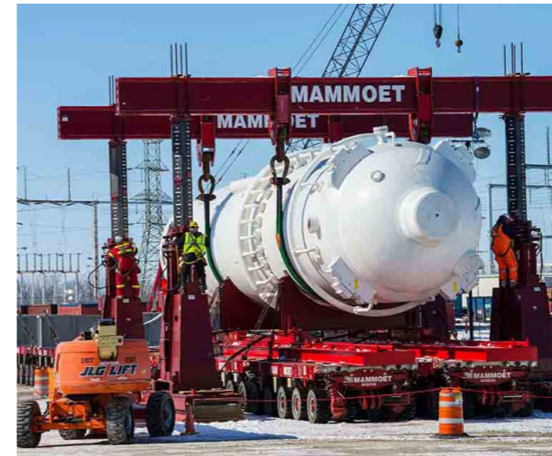
STEAM GENERATOR REPLACEMENT MODELS PENNSYLVANIA, USA