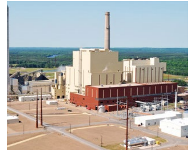
KEWAUNEE NUCLEAR POWER PLANT WISCONSIN, USA