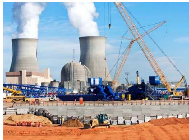
PLANT VOGTLE UNITS 3 + 4 WAYNESBORO, GEORGIA, USA