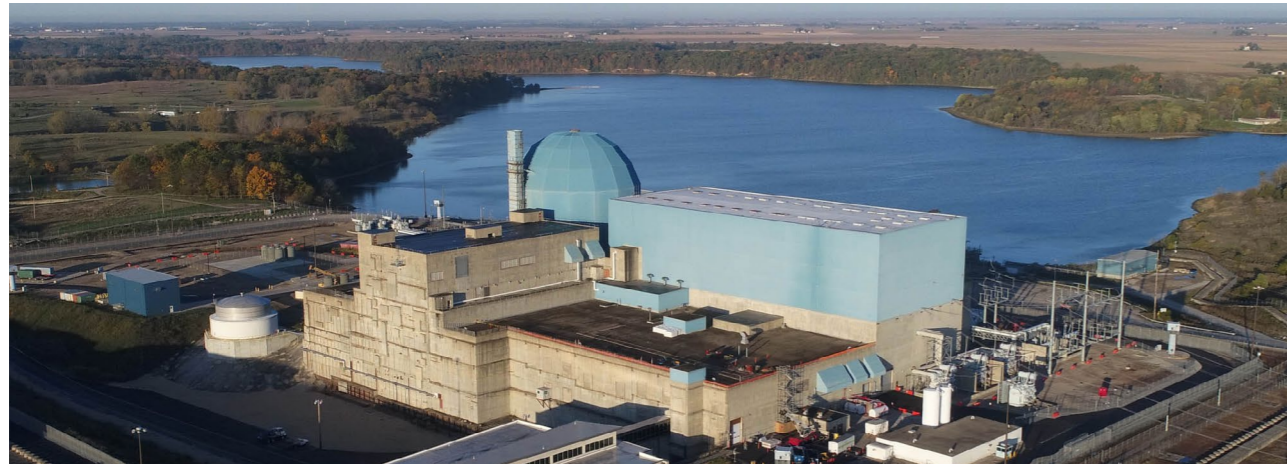
CLINTON POWER PLANT CLINTON, ILLINOIS, USA