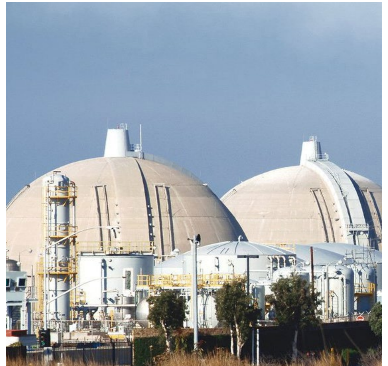
SAN ONOFRE NUCLEAR POWER PLANT PENDLETON, CALIFORNIA, USA