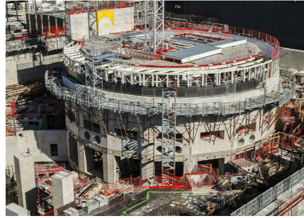
ITER, WORLD'S LARGEST NUCLEAR FUSION EXPERIMENTAL PROJECT FRANCE