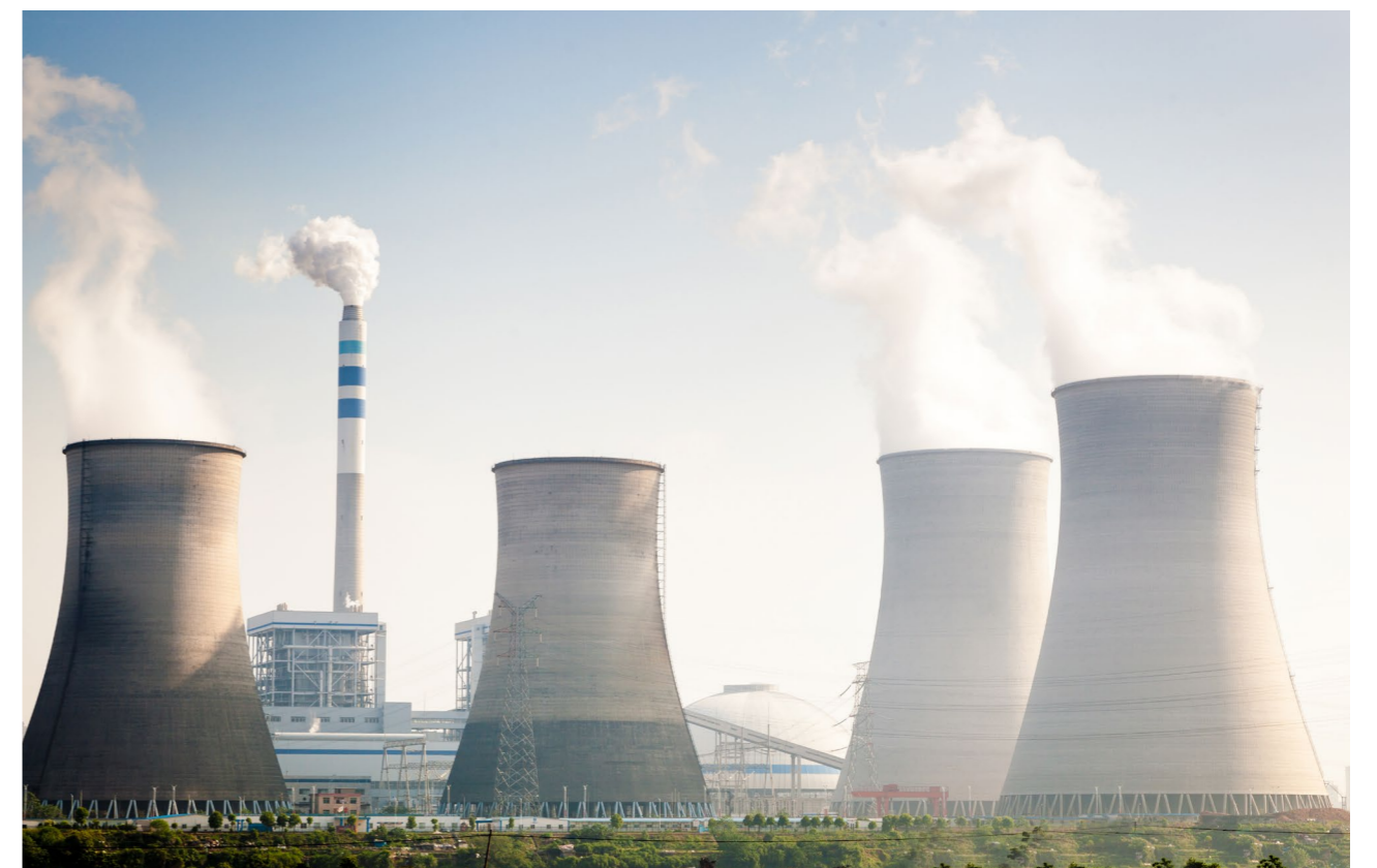
THE BATAAN NUCLEAR POWER PLANT PHILIPPINES