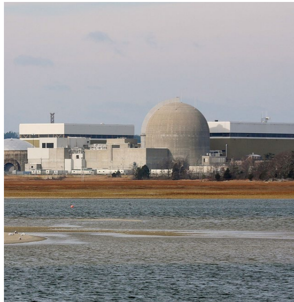
SEABROOK POWER PLANT SEABROOK, NEW HAMPSHIRE, USA

The following is a representative selection of projects where HKA has provided a range of consulting, expert and advisory services.