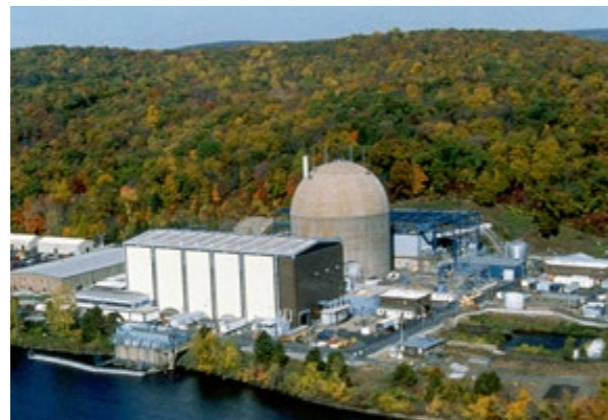
CONNECTICUT YANKEE NUCLEAR PLANT MIDDLESEX COUNTY, CONNECTICUT, USA