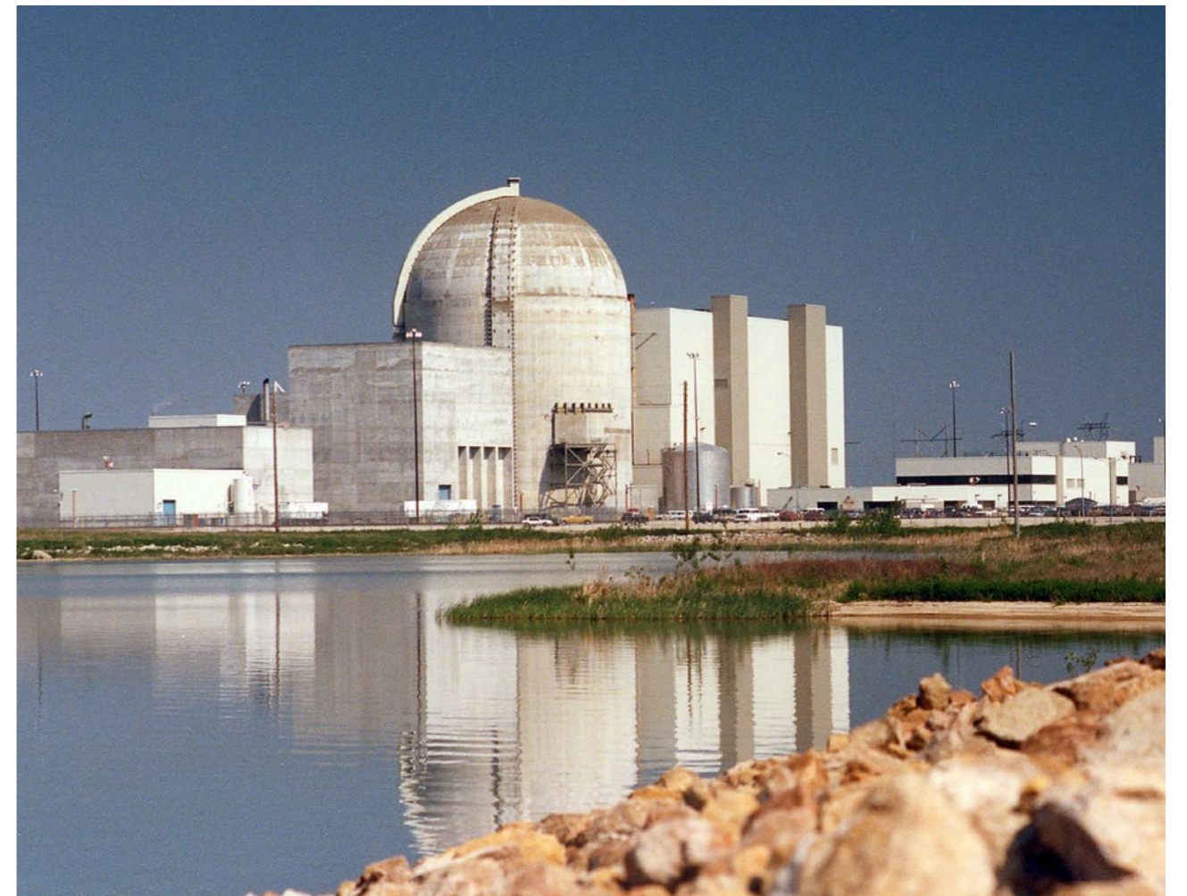
WOLF CREEK NUCLEAR POWER PLANT BURLINGTON, KANSAS, USA