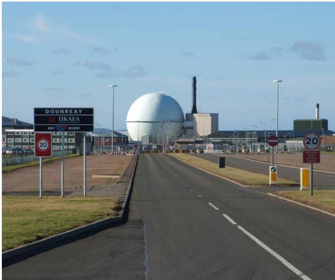
DOUNREAY NUCLEAR POWER STATION CAITHNESS, SCOTLAND, UK