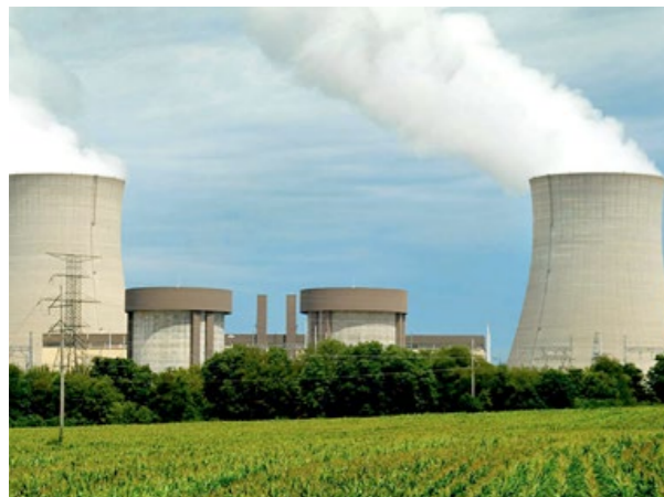
BYRON AND BRAIDWOOD NUCLEAR POWER PLANTS OGLE COUNTY, ILLINOIS, USA