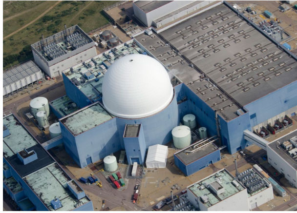
SIZEWELL B NUCLEAR POWER STATION SUFFOLK, ENGLAND, UK