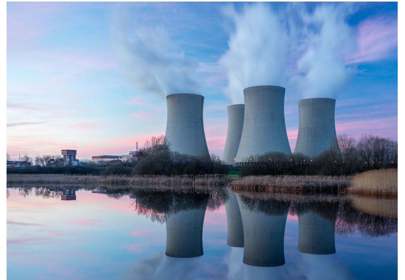
LUNGMEN NUCLEAR POWER PLANT NEW TAIPEI CITY, TAIWAN