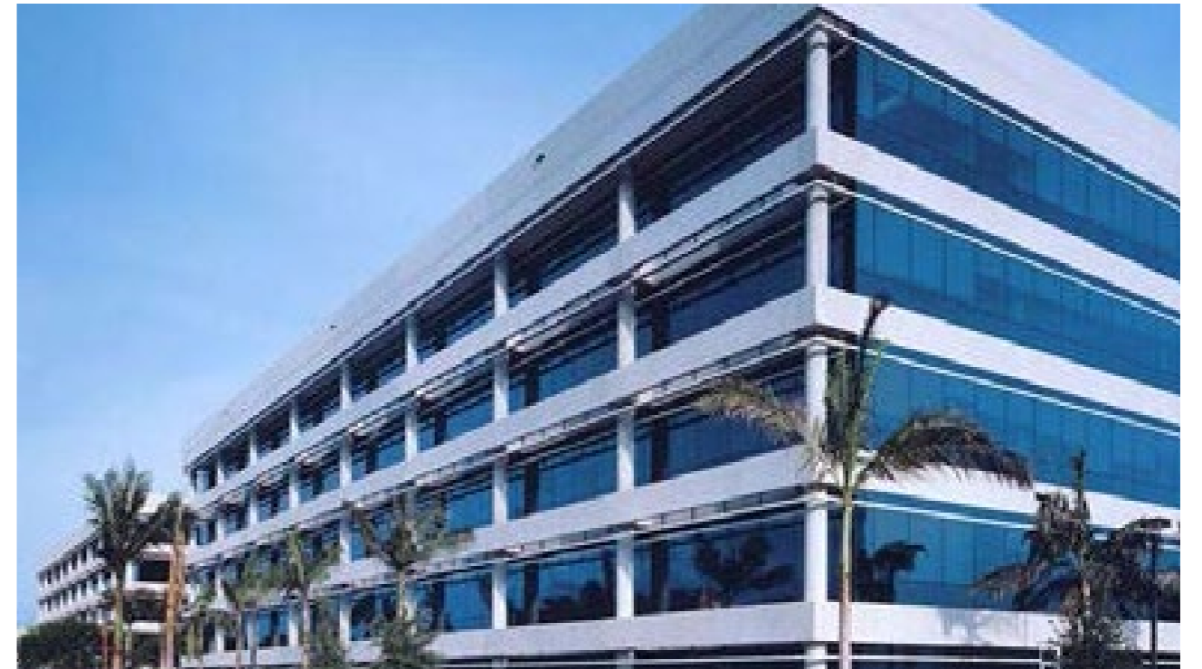
UPRATE OF FOUR NUCLEAR POWER PLANT REACTORS FLORIDA AND WISCONSIN, USA