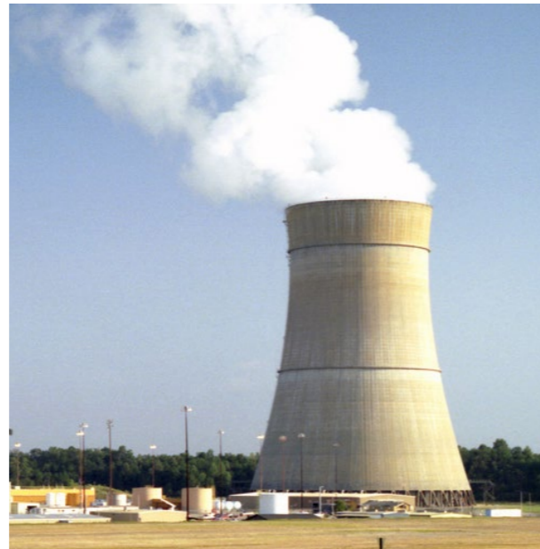
GRAND GULF NUCLEAR STATION CLAIBORNE COUNTY, MISSISSIPPI, USA