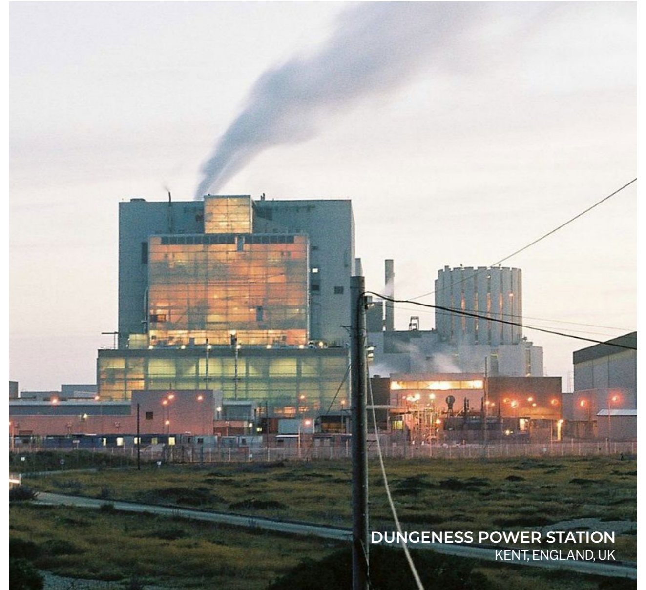
DUNGENESS POWER STATION KENT, ENGLAND, UK