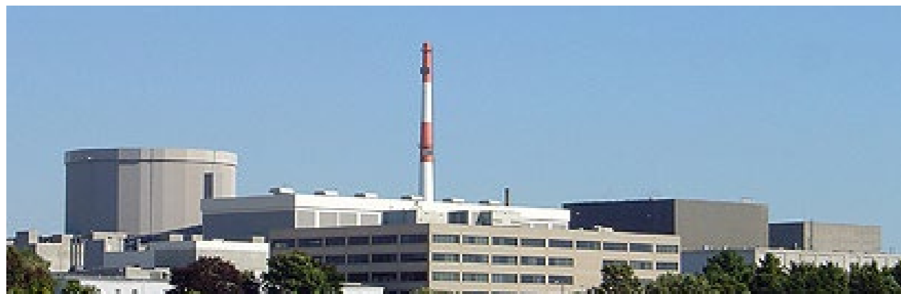
MILLSTONE & CONNECTICUT YANKEE POWER PLANTS NEW LONDON COUNTY, CONNECTICUT, USA