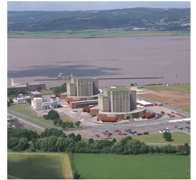
BERKLEY POWER STATION GLOUCESTERSHIRE, ENGLAND, UK