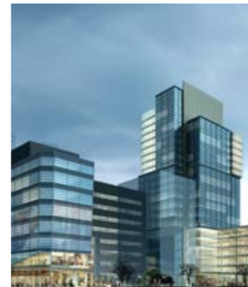
Real Estate & Development