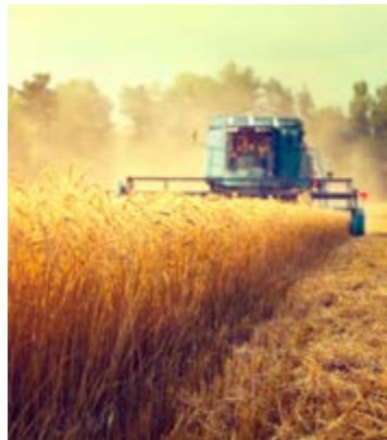
Manufacturing & Agriculture