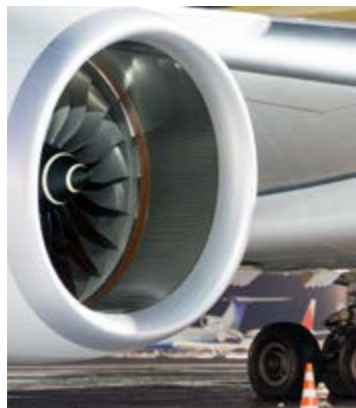
Aerospace & Defence

Our commercial damages experts have been engaged on a variety of projects around the world and possess specialist industry experience. We have regularly consulted on behalf of both listed and private global companies, governments, claimants and respondents, across various industries, including: